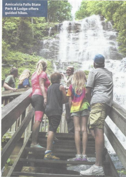
Amicalola Falls State Park & Lodge offers guided hikes.

When not tackling business, opportunities abound for team building. The Adventure Lodge program debuted in June 2015 at both parks, through a joint venture between Coral Hospitality and the North Georgia Mountains Authority, which is focused on building safe and innovative adventure attractions. Adventure activities vary by park and include ziplines, archery, guided hikes, climbing walls, survivalist camp, GPS scavenger hunts, fly fishing, paddle boarding, mountain biking and