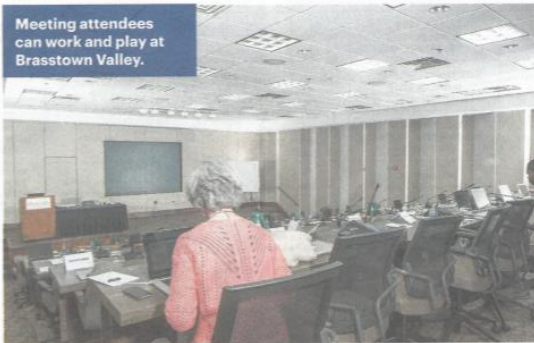
Meeting attendees can work and play at Brasstown Valley.