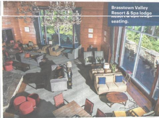
Brasstown Valley Resort & Spa lodge resort to open large seating.

traditional rooms, five suites and eight four-bedroom cabins, Brasstown is positioned to serve the group market, which has been growing steadily there since the