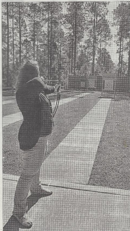
New archery range at Veterans State Park.

and personal. Veterans Park is a well-groomed and scenic resort property. Resolve to plan a family getaway to a Georgia State Park in 2018 and Georgia Veterans Park would be an excellent choice. Go to lakeblackshearresort.com" www.